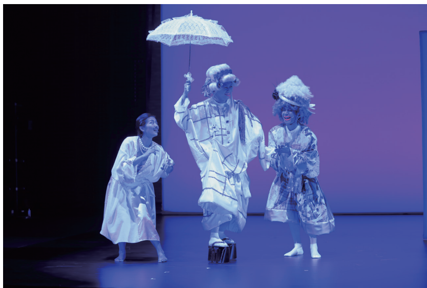
Sandaime Richard, 2016

Shakespeare is put on trial for falsifying history and defaming Richard III, the Grand Master of Ikebana !? In this witty satire of power, Shakespeare is being prosecuted by none other than the Marchant of Venice - Maachan, who has forever been condemned by the writing of Shakespeare, pits wits against the writer. Who will win?